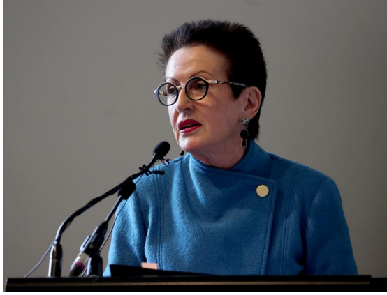
📷 Lord Mayor Clover Moore put the onus back on the State Government.

Cr Moore hit back saying Cr Chung was “ignoring” expert advice from council staff, who are examining “every possible measure” to find the most effective option.