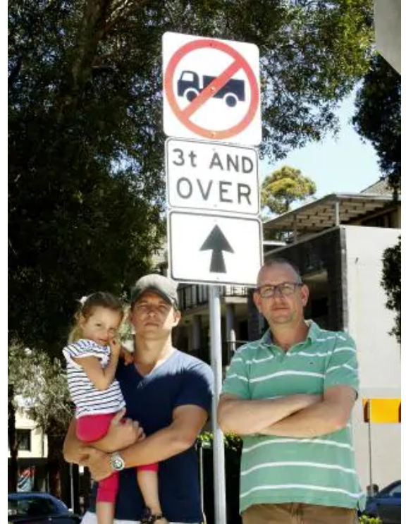
📷 The issue has dragged on for two years.

“Until these performance reviews are carried, Transport for NSW does not support the partial or full closure of Maddox St,” she said.