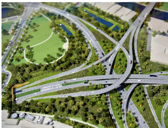
📷 A model showing the WestConnex New M5 St Peters interchange.